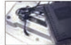
*AC Adapter (9V/1500mA)