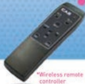
*Wireless remote controller